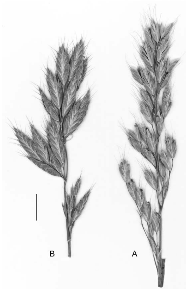
Fig. 1. A: Bromus parvispiculatus (from the holotype, Willing 87413). – B: B. hordeaceus subsp. mediterraneus (France, Var, 1860, F. Schultz, herbarium normale, nov. Ser. Cent. 13, No. 1272 as B. molliformis ). – Scale bar = 1 cm.

of glumes and lemmas on drying, a relative high lemma awn insertion of 0.5-1.7 mm below the obtuse or short-bilobed lemma apex as well as the more or less spreading, softly and densely long-hairy indumentum at least on the lower leaf sheaths (except for B. hordeaceus subsp. longipedicellatus , a probably hybrid derivative; Spalton 2001). The interrelationships of all these taxa are obscure. Some similarities in the loose panicle configuration of B. hordeaceus subsp. pseudothominei (6.5-8 mm long lemmas; the mostly non-weedy subsp. thominei , similar in lemma size, differs, e.g., by its compact inflorescences!) and B. parvispiculatus may one lead to the assumption that the latter is the Mediterranean vicariant of the more northerly distributed subsp. pseudothominei and should therefore better be treated as a subspecies of B. hordeaceus .