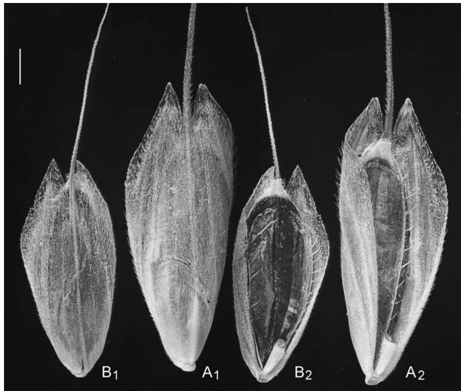
Fig. 2. Florets in fruiting state (1 = dorsal and 2 = ventral view) – A: Bromus incisus (from Otto 10651); B: B. lepidus (from Otto 10461). – Scale bar = 1 mm; photograph by Otto.

The Herbarium of the Botanical Museum Berlin-Dahlem (B) holds a mounted specimen of an annual brome grass obtained in 1946 from R. Gross, who himself received it from the National Her-