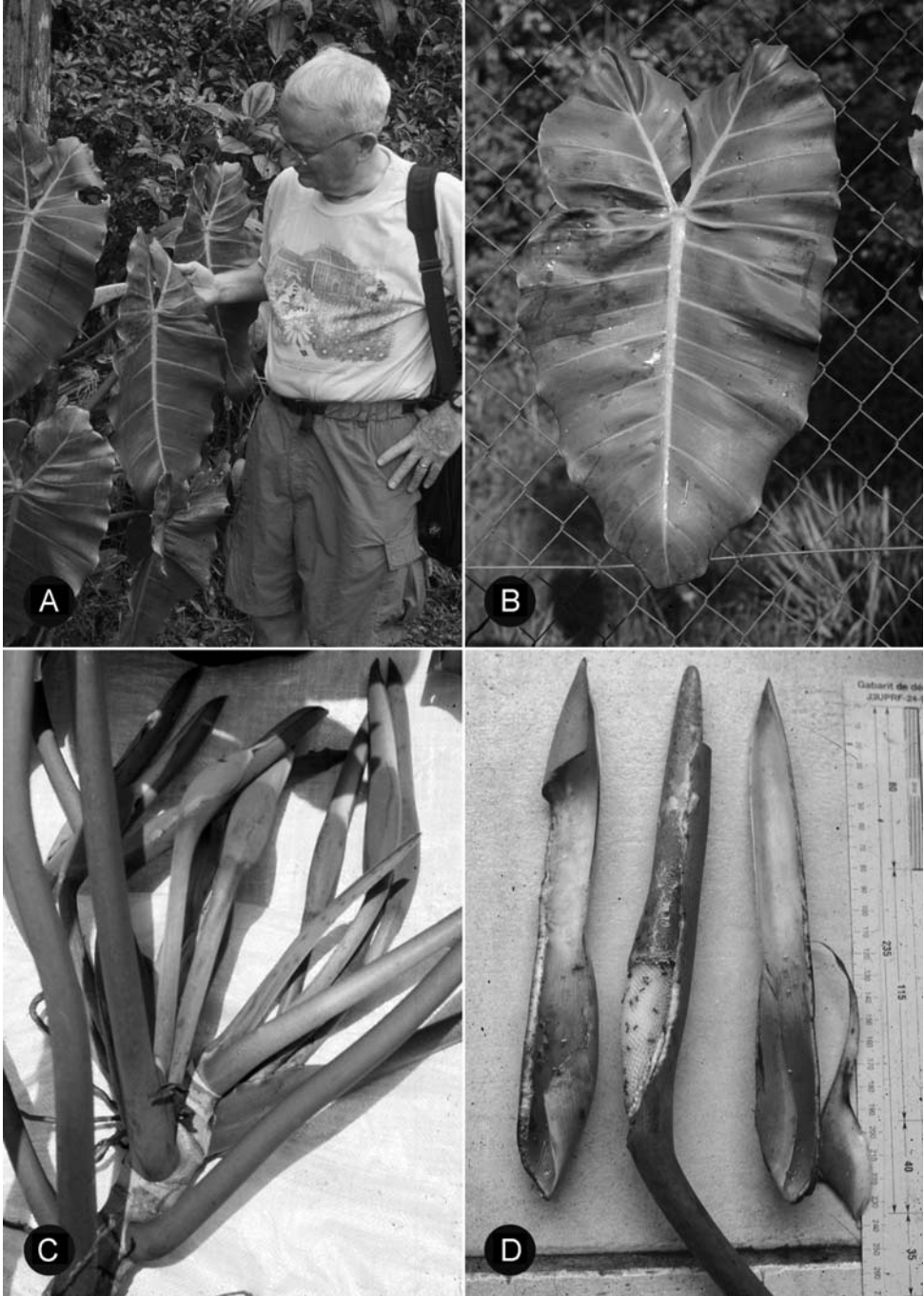
Fig. 2. Philodendron scottmorianum – A: habit of plant in cultivation with Dr Scott Mori at Emerald Jungle Village, French Guiana; B: leaf blade showing adaxial surface; C: stem with bases of petioles and clusters of inflorescences borne in two different leaf axils; D: inflorescence cut open to expose the inner surface of spathe and the spadix (centimetre ruler to show scale).