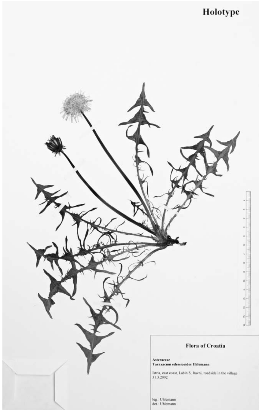
Fig. 2. Taraxacum edessicoides , holotype specimen at B.