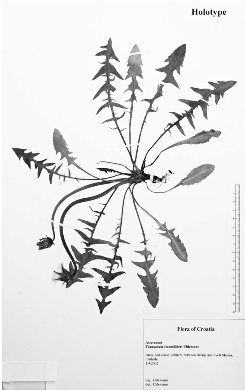
Fig. 1. Taraxacum starmuehleri , holotype specimen at B.