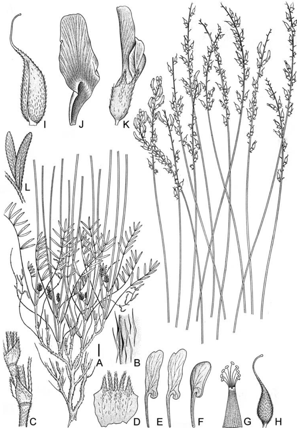
Fig. 1. Astragalus kiviensis – A: habit (with fruits); B: indumentum of calyx; C: stipules; D: calyx; E: wings; F: keel; G: androecium; H: gynoecium; I: pod; J: standard; K: flower; L: leaflet pair. – Scale bar: A = 1 cm, C, L = 2.5 mm, D-K = 1.25 mm; drawn after the type collection.