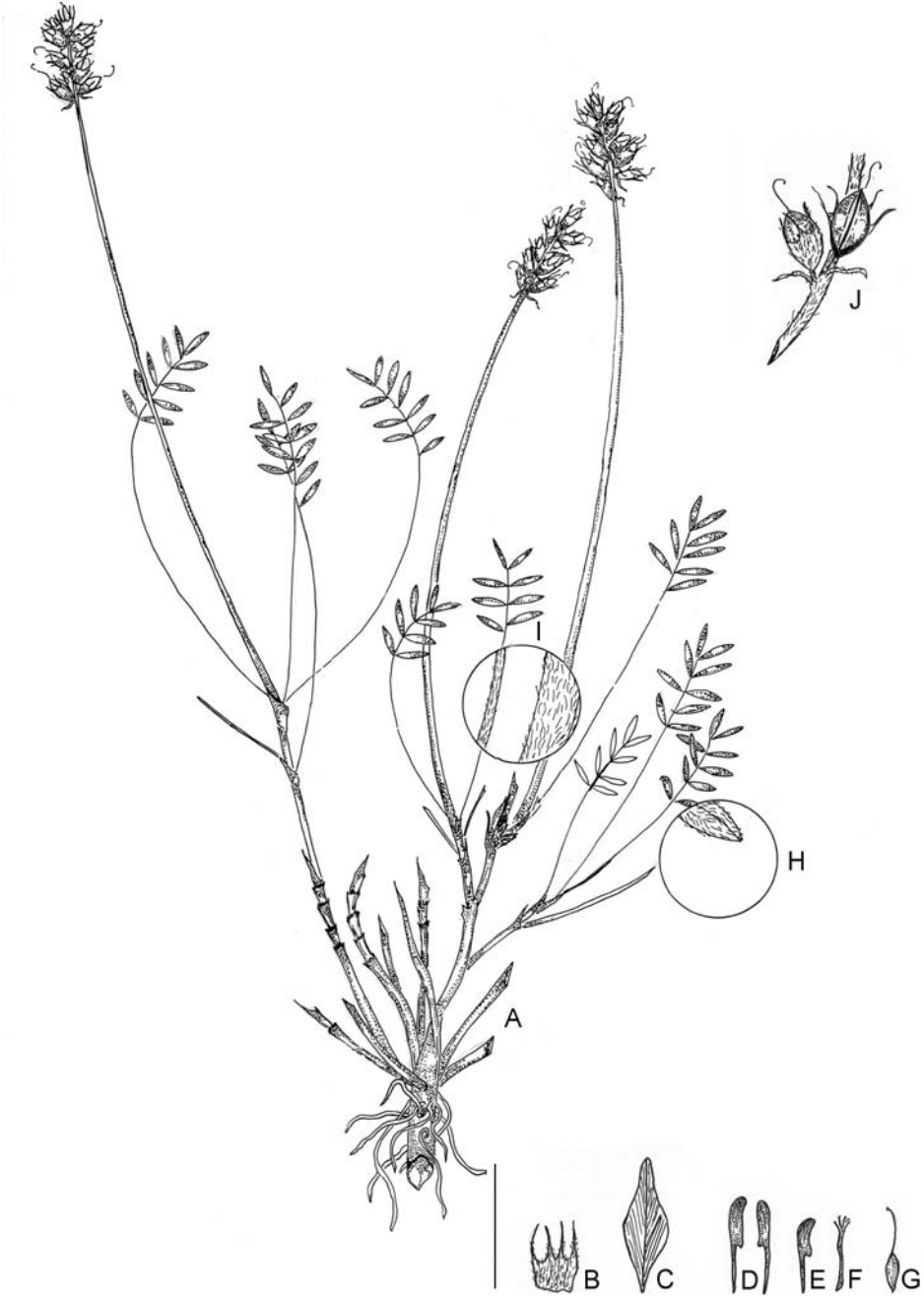
Fig. 2. Astragalus kadschoroides – A: habit (with fruits); B: calyx; C: standard; D: wings; E: keel; F: androecium; G: gynoecium; H: indumentum of leaflet; I: indumentum of rachis and peduncle; J: pod. – Scale bar A = 3 cm, B-G, J = 1.5 cm; drawn after the type collection.