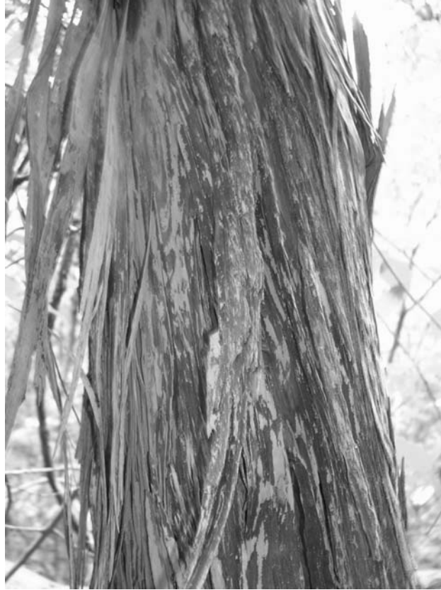
Fig. 2. Trunk of Tetrazygia decorticans , with bark peeling off in laminar shreds.

species is very rare. It occurs from 600-650 m in seasonally wet evergreen forest. Associated melastome species include: Miconia prasina (Sw.) DC., Meriania leucantha subsp. nana (Triana) Borhidi, Tetrazygia bicolor (Mill.) Cogn. and Clidemia barbeyana Cogn. Other associated species include Calyptronoma plumeriana (Mart.) Lourteig, Cyathea arborea (L.) Sm., Alsophila cubensis (Underw. ex Maxon) Caluff & Shelton, Cinnamomum montanum (Sw.) J. Presl, Ocotea leucoxydon (Sw.) Mez, Guarea guidonea (L.) Sleumer, Talipariti elatum (Sw.) Frixell, Roystonea regia (Kunth) O. F. Cook, Dendropanax arboreus (L.) Decne. & Planch., Faramea occidentalis (L.) A. Rich., Wallenia laurifolia (Jacq.) Sw., Citharexylon caudatum L., Casearia sylvestris Sw. subsp. sylvestris and Tabernaemontana ambliocarpa Urb.