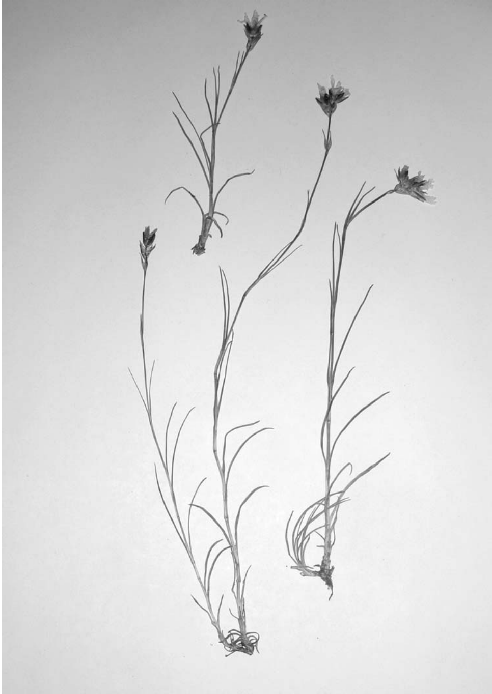
Fig. 2. Arenaria dianthoides subsp. tuncbasi – isotype at AYDN.