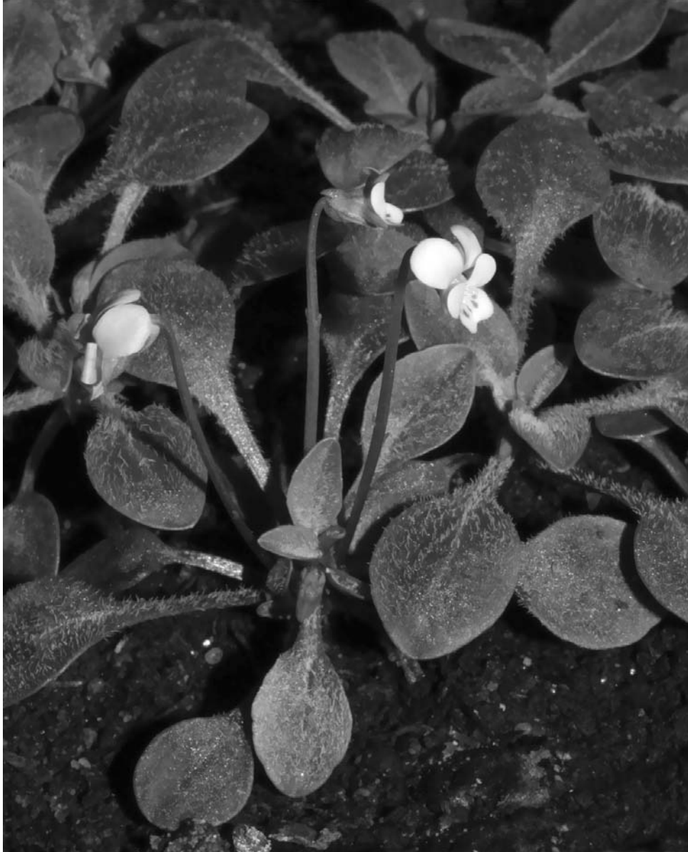
Fig. 3. Viola dirimliensis – cultivated plants raised from Eren & Şirin 4738 (herb. Parolly).

for colour photographs see the electronic supplement). This number is also new for the genus and fills the single gap in the descending aneuploid series from x = 11 to x = 2 in V. sect. Melanium (Erben 1996). V. rauliniana has 2n = 36 (Erben 1985), and thus must be deleted from the flora of Turkey. The Turkish plant can neither be seen as a putative subspecies of V. rauliniana , as was our hypothesis for some time, nor is it close to V. mercurii , endemic to the eastern Peloponnisos, which is clearly distinct from V. dirimliensis in many morphological characters and 2n = 10 , as has V. parvula .