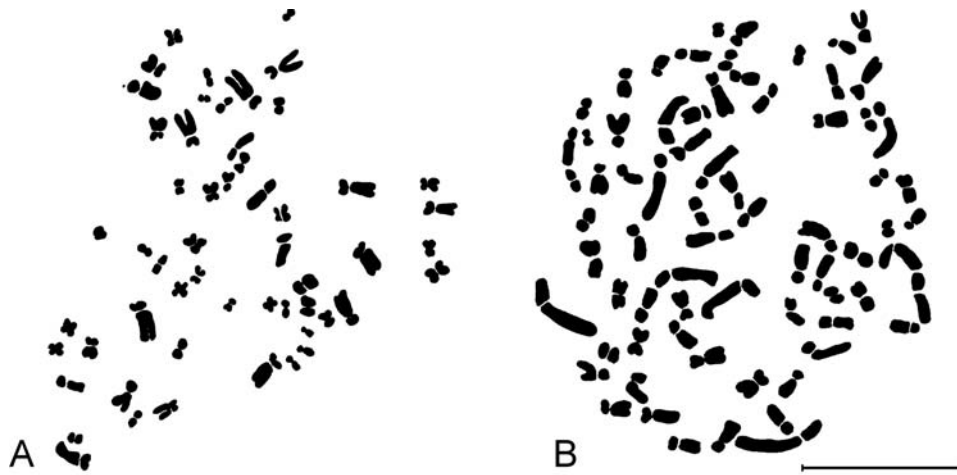
Fig. 2. Mitotic metaphase plates of Limonium narbonense – A: 2n = 6x = 54 , material from Magnisia, Chrisi Akti Panagias (Georgakopoulou & Manousou 214a); B: 2n = 8x = 72 (Georgakopoulos & Manousou 214). – Scale bar = 10 \mu\text{m} .

The populations of Limonium narbonense were found to be hexaploid with 2n = 6x = 54 and octoploid with 2n = 8x = 72 (Table 1, Fig. 2). The chromosome number 2n = 6x = 54 has also been counted for the closely related Greek endemic L. brevipetiolatum (Artelari & Erben 1986) as well as for the European relative L. humile Mill. (Erben 1979). L. narbonense was known so far as tetraploid with 2n = 36 from Greece (Artelari 1992) and as diploid with 2n = 18 and as tetraploid from the wider Mediterranean region (Baker 1953c, Erben 1978, 1979, 1993, Brullo & Pavone 1981, Palacios & al. 2000). Both hexaploid and octaploid karyotypes lack the ‘marker’ chromosomes (Fig. 2) and this is also the case in the karyotype with 2n = 36 (Erben 1978, Artelari 1992). As is shown in Table 1, at the locality “Chrisi Akti Panagias” both chromosome numbers 2n = 54 and 72 were counted. In this place, individuals with 2n = 72 were found in the exterior side of the bay, exposed to wind and waves and it seems that their high ploidy level is a response to the extreme ecological conditions. These plants are more robust and advanced in flowering than those with 2n = 54 , but the detailed study of their morphological characters did not show any other significant difference. The octaploid number 2n = 72 is the highest reported so far for the genus Limonium .