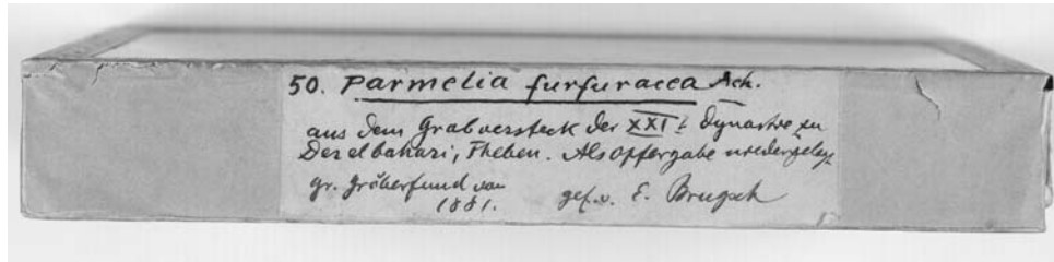
Fig. 2. Label (handwritten by G. Schweinfurth) for the sample of Fig. 1. Translation: “50. Parmelia furfuracea Ach. from hidden grave of XXI dynasty in Dez el bahari, Thebe. Laid down as offering. Large grave discovery of 1881. Found by E. Brugsch”. – Collection of Georg Schweinfurth at the Botanical Museum Berlin-Dahlem.

puted as referring to the lichen Aspicilia esculenta (Pall.) Flagey, whose thick wrinkled crusts when detached from rocks in significant quantities can be exploited as food or as fodder for the livestock (Richardson 1988). However, although this lichen is widespread in the Middle East, we have not found any published record from Egypt. It should be noted that there are several other interpretations of “manna from heaven”.