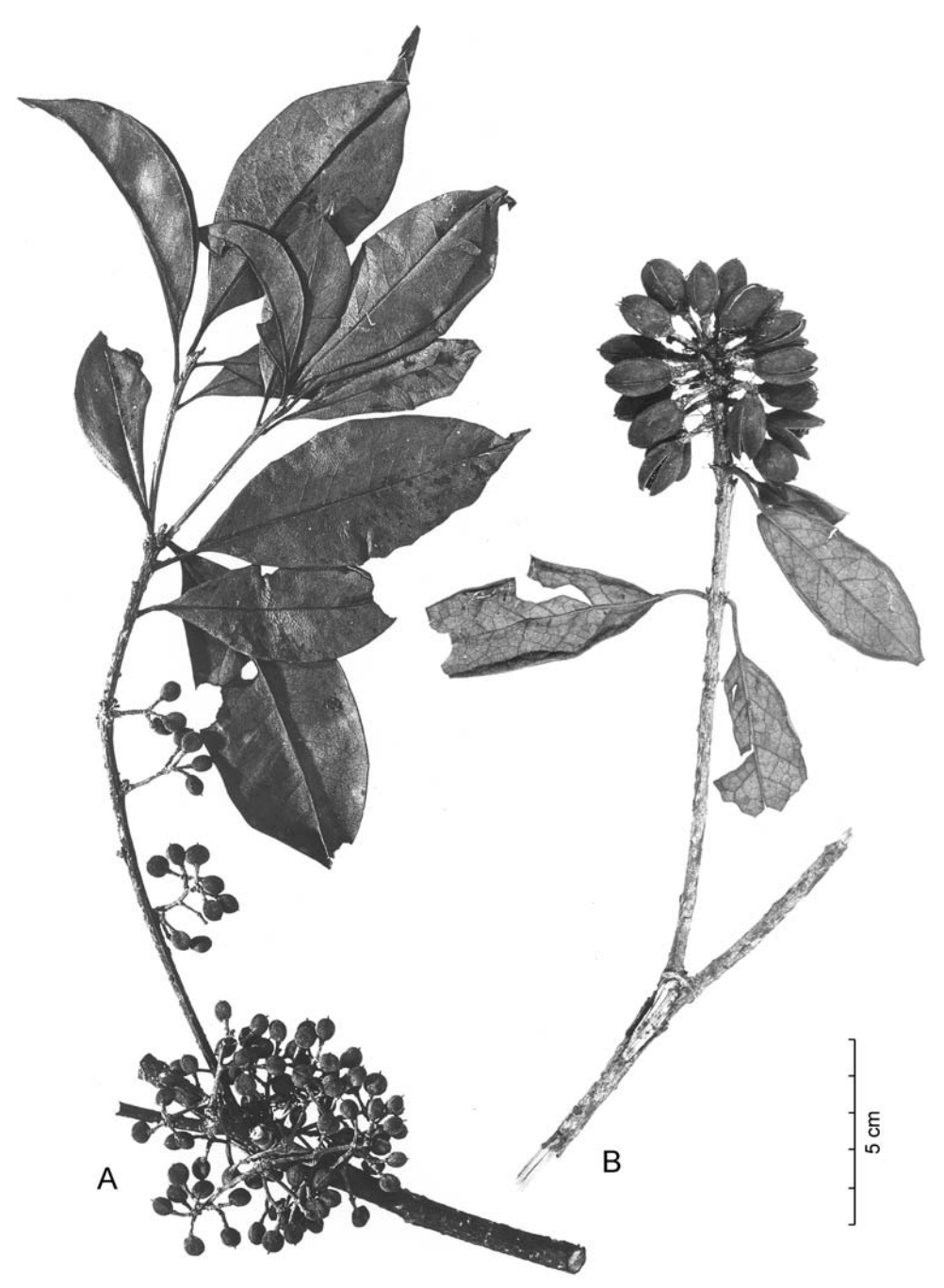
Fig. 2. Eipo name mena for two very different species – A: Pittosporum ramiflorum (Zoll. &. Moritzi) Miq. (Hiepko & Schultze-Motel 1446); B: Pittosporum pullifolium Burkill (Hiepko & Schultze-Motel 1216).