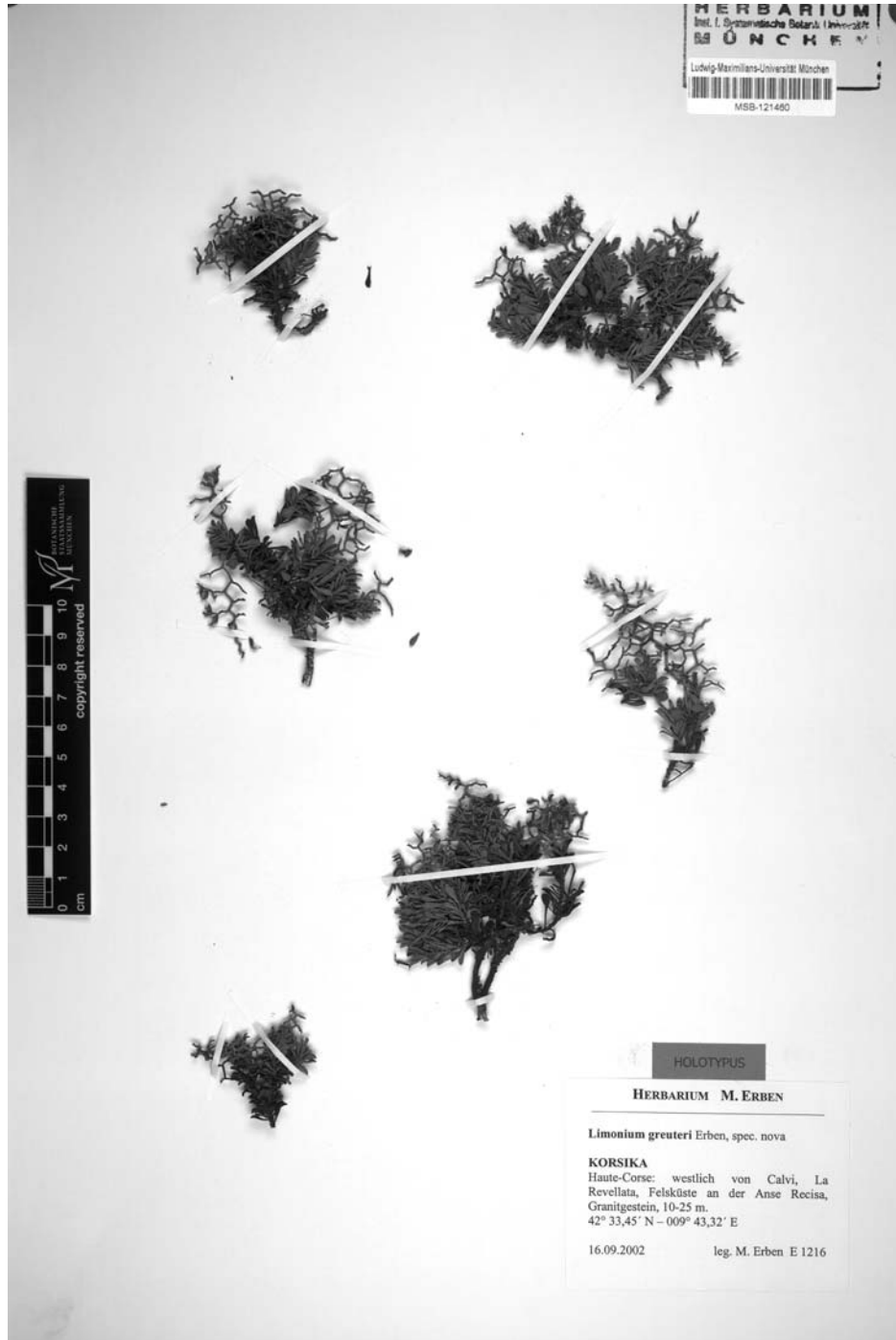
Fig. 1. Limonium greuteri , holotype.