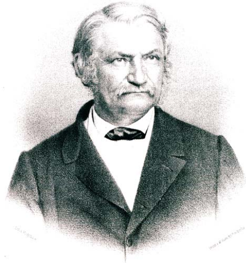
Fig. 1. Portrait of Kotschy [from Schweinfurth 1868].

Kotschy also made freshwater fish collections from around Shiraz, including the streams of the Maharlu basin in the Shiraz valley, the Kor River basin north of Shiraz, the Mond River (=