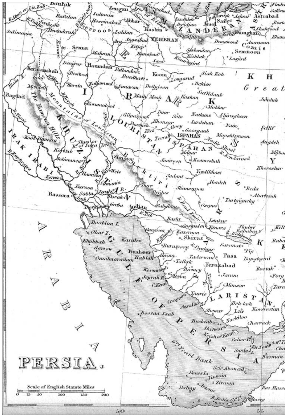
Fig. 2. Map of Iran by Dower (1836) showing area of study.