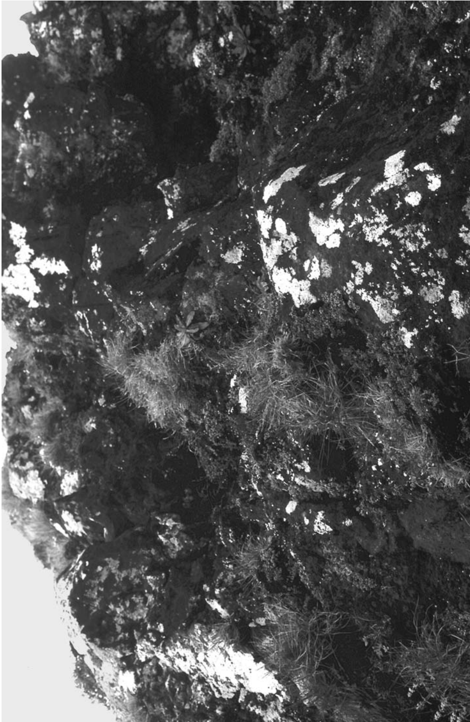
Fig. 2. Lolium saxatile in its habitat on Fuerteventura in the northern escarpment of Pico de la Zarza, c. 800 m.