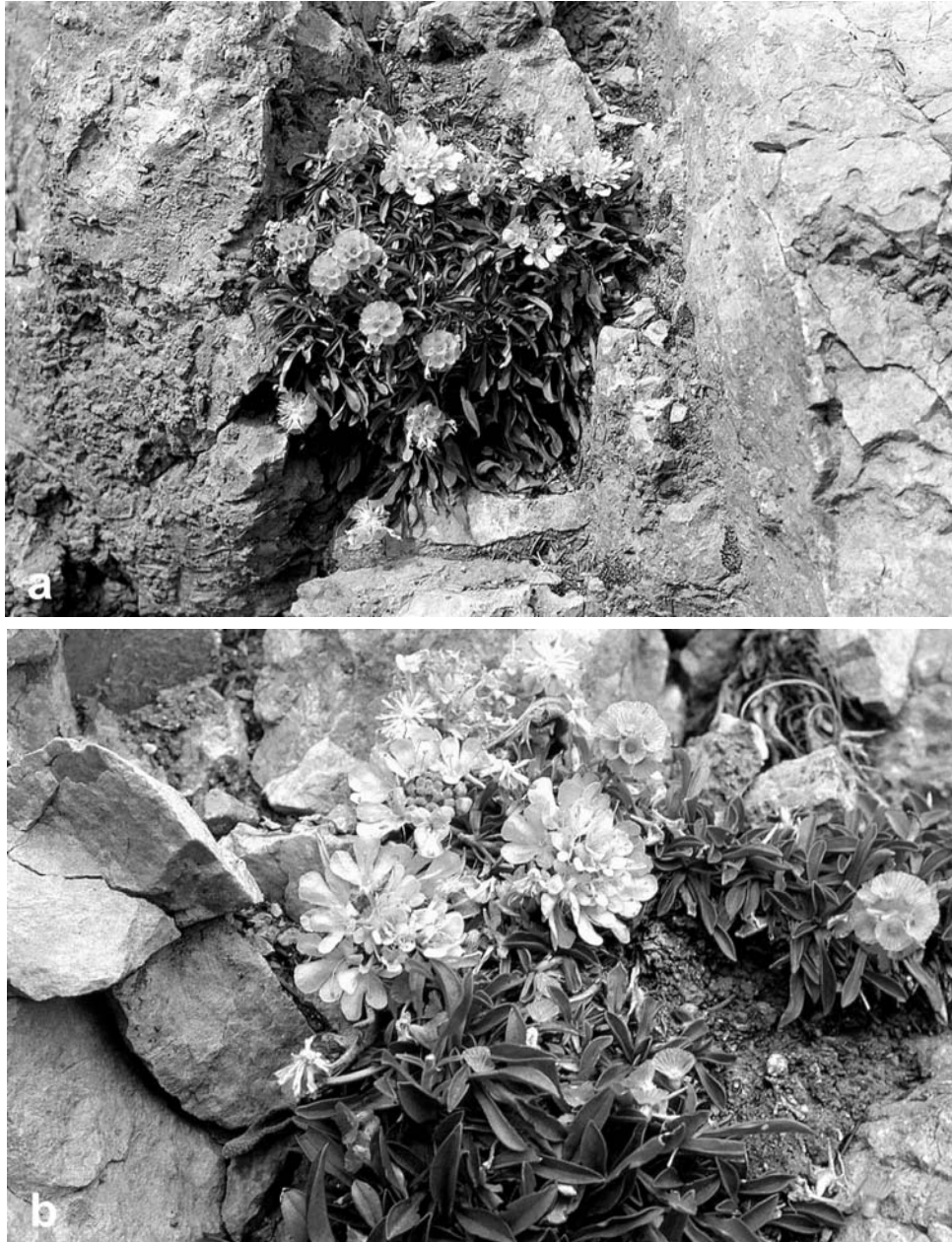
Fig. 2a-b. Lomelosia solymica in its natural habitat [Turkey, C3 Antalya, Tahtalı D.]; note the dispersed fruits in b.

long and with (4-)5 very unequal lobes, outside loosely lanate-pubescent, inside with scattered stalked glands; lobes of the 3 lower segments elliptic, obovate to narrowly ovate, 4.5-5.5 × 3-4 mm, the 2 upper broadly obovate, 2-2.5 × 2-2.5 mm. Stamens 4(-5), long exerted; filaments whitish to rarely pale purplish in upper part, 6-12 mm long, flattened, winged; anthers pale pinkish