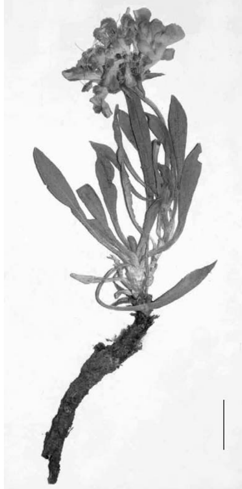
Fig. 1. Lomelosia solymica – specimen Ulrich 4/24a (herb. Parolly). – Scale bar = 1 cm.

(10-)15-35(-40) × 2-6 mm, narrowly obovate to spatulate or oblanceolate, tapering into a narrow base, apex mostly acute, less often mucronulate to obtuse. Stem leaves similar, but smaller in size than rosette leaves, very few, often reduced to bracts. Peduncle 1-2 cm long, c. 0.7 mm in diam., leafless. Capitula solitary, in flower flattened-hemispherical, radiant, (15-)20-25(-30) mm in diam., in fruit globose, 12-17 mm in diam. Involucre bracts 8, in two series, distinctly (3-)5-7-veined outside, variable in shape and density of the indumentum, outer surface thinly to densely pubescent, inner surface often glabrous; outermost bracts green, mainly with paler centres and purplish margins, ovate to ovate-lanceolate, often gibbous in the middle, 4-6 × 2-3 mm, apex apiculate to obtuse; innermost bracts similar but smaller in size, gradually merging into the receptacular bracts. Receptacular bracts white, with purplish or green tips, scale-like, keeled, oblanceolate to narrowly ovate, 3-5 × 1.2-2 mm, herbaceous with a hyaline membranous margin clearly dilated towards the base or only with herbaceous tip and vein, apex ± rounded, hairs as in involucre bracts but thinner. Florets 14-20, pale mauve, lilac to pinkish, the outer strongly radiant, 11-13 mm long. Corolla with a narrowly infundibuliform, white-lanate tube, c. 4.5-7 mm