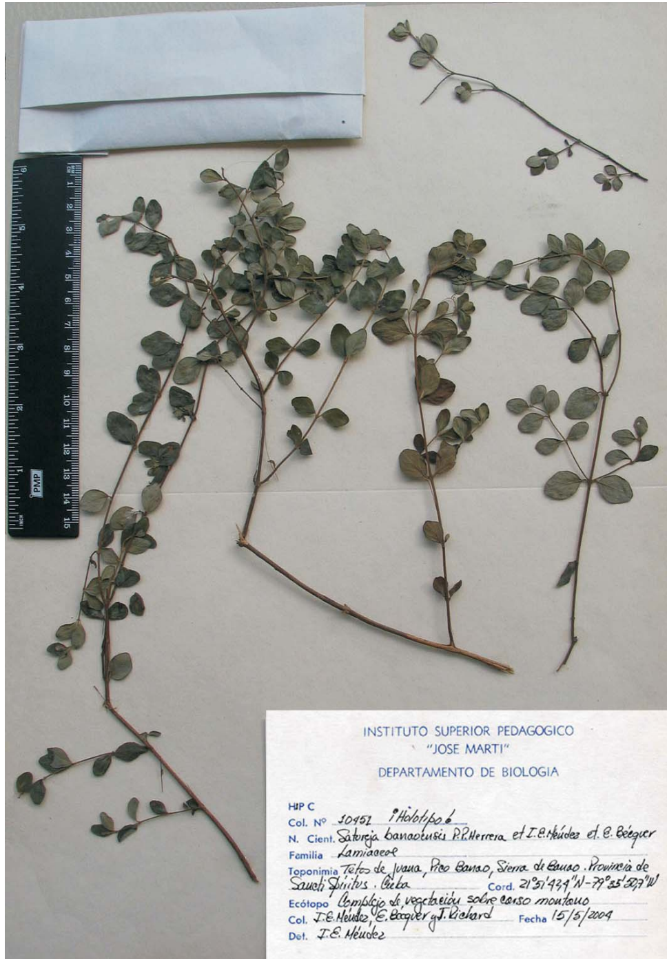
Fig. 1. Satureja banaoensis – holotype.