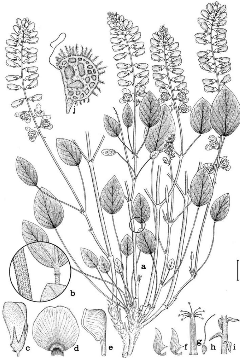
Fig. 1. Onobrychis aurea – a: habit; b: leaf (abaxial and adaxial views); c: flower; d: standard; e: keel; f: wings; g: androecium; h: pistil; i: bracts; j: fruit. – Scale bar for a = 2 cm, b-i = 0.5 cm, j = 0.3 cm.