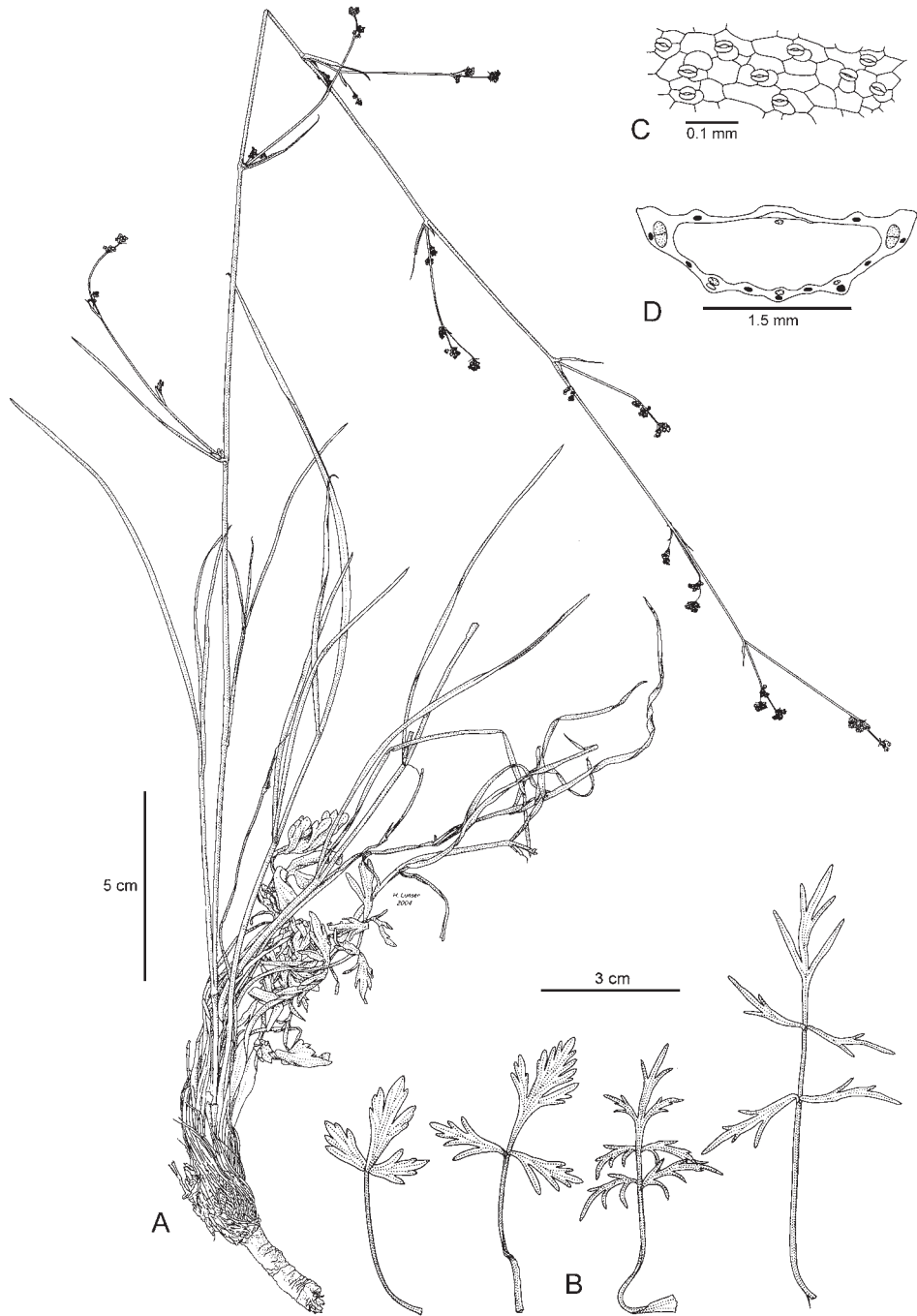
Fig. 1. Peucedanum isauricum – A: habit (after the holotype); B: sequence of basal leaves from outer radical to inner basal leaf (after R. Ulrich 3/27, herb. Parolly); C: epidermis with stomata from lower surface of stem-leaf (after R. Ulrich 1/16, STU); D: transverse section of mericarp; dotted: vascular bundles, black: oil ducts (after R. Ulrich 3/27, herb. Parolly).