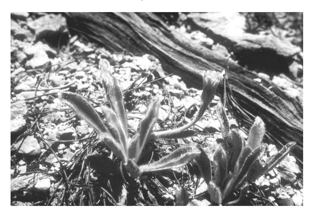
Fig. 1. Scorzonera karabelensis – photograph, from the type locality, by R. Ulrich, 2003.