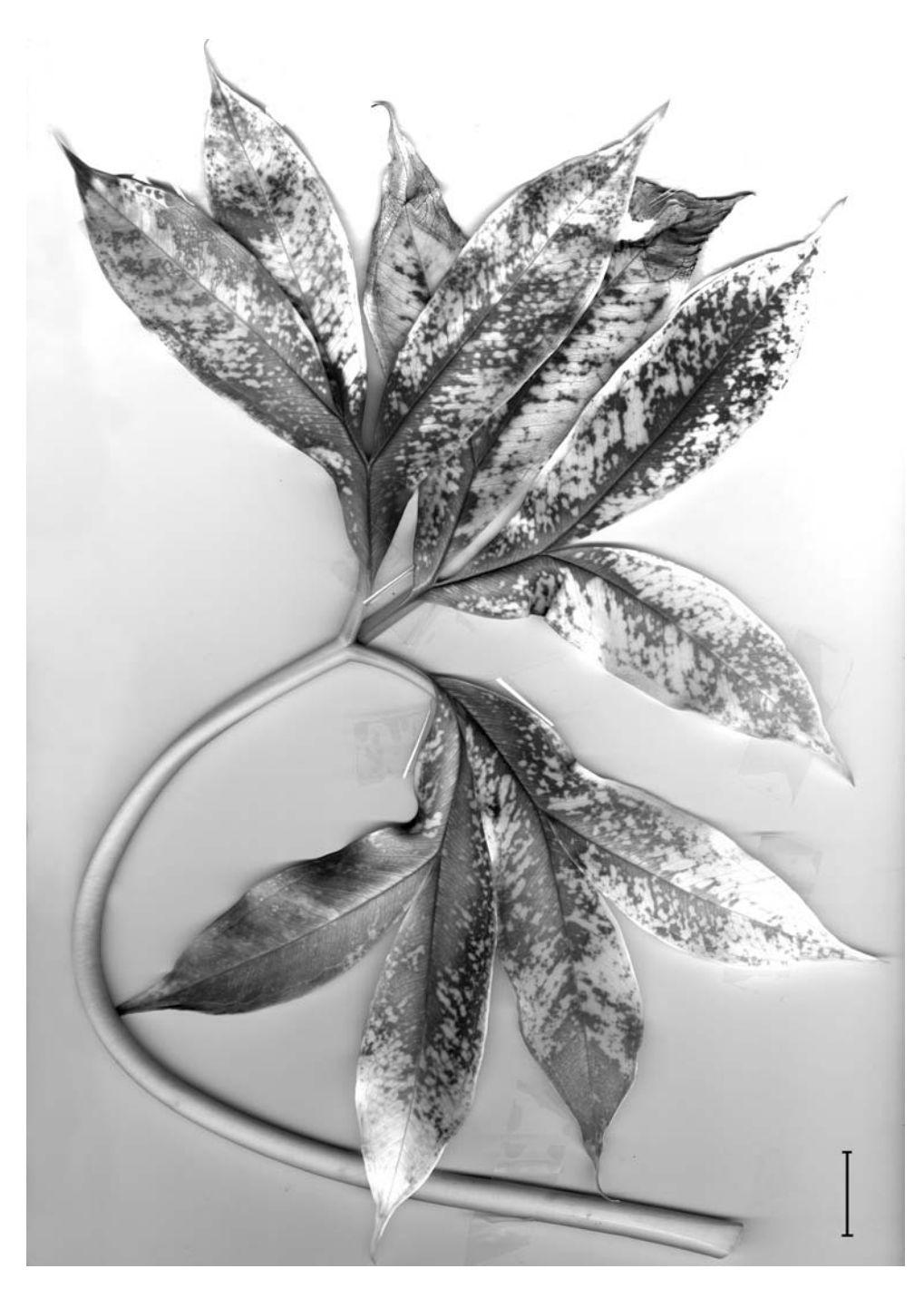
Fig. 2. Amorphophallus mangelsdorffii – Leaf from a cultivated plant originating from the locus typicus. – Scale bar = 2 cm; photograph by R. Mangelsdorff.