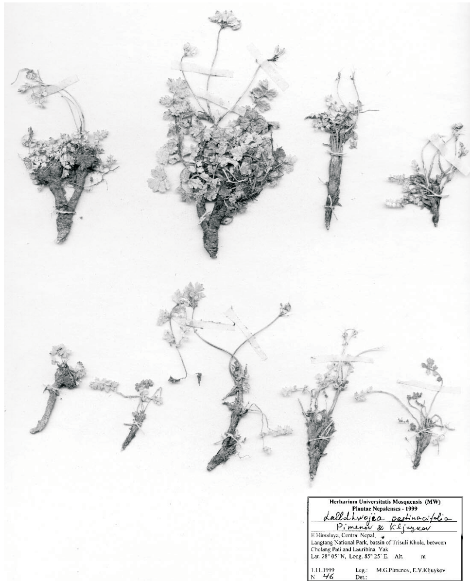
Fig. 1. Lalldhwojia pastinacifolia Pimenov & Kljuykov (holotype specimen at MW).

Plantae perennes , polycarpicae, caudicibus pauciramosis vel integris, vix incrassatis, a collo residuis fibrosis petiolorum foliorum tectis, radicibus principalibus verticalibus, lateralibus funiformibus. Caules solitarii , eramosi, aphylli, fructificatione paene glabri, tenues, sulculati. Folia radicalia plus minusve numerosi, rosulantia, petiolis 1-3 cm longis, laminis pinnatis, 4-6-jugatis, 3-5 × 1-2 cm, ambitu lanceolatis vel lanceolato-linearibus, segmentis sessilibus, late