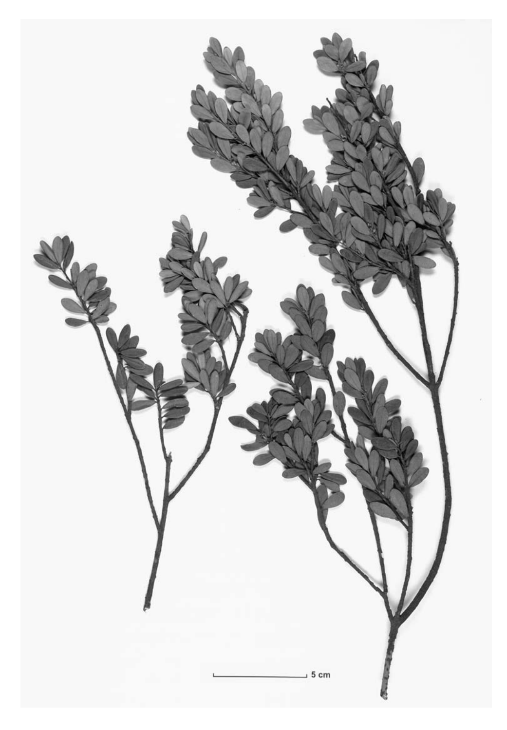
Fig. 2. Isotype specimen of Polygala guantanamana subsp. alternifolia (PFC 42965, B).