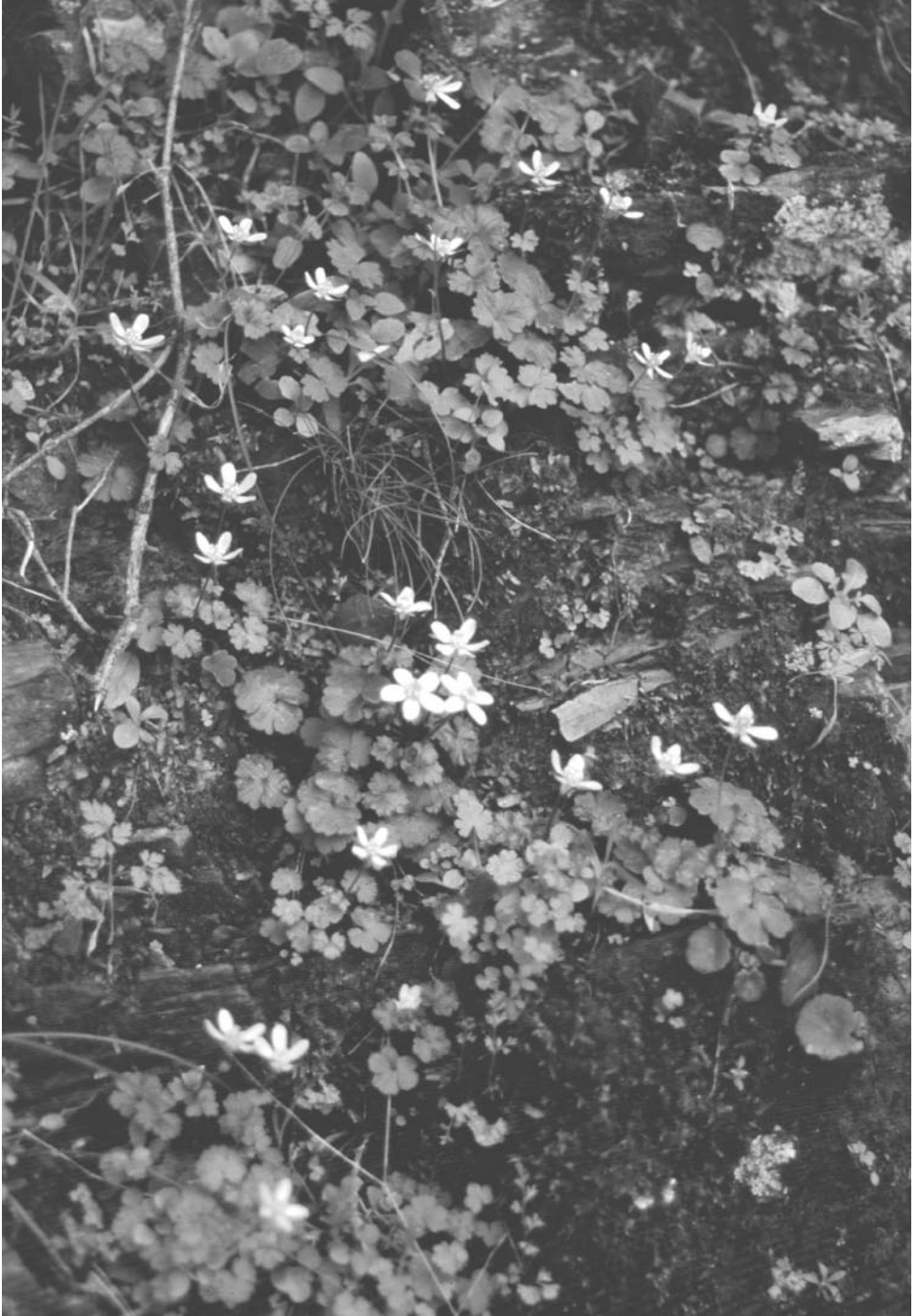
Fig. 3. Ranunculus veronicae – plants at the locus classicus near Kambos, Crete.