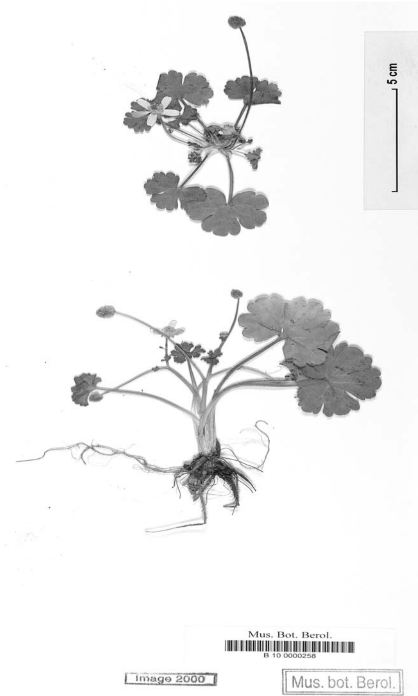
Fig. 2. Ranunculus veronicae – plants of the holotype sheet (Böhling 7066) at B.