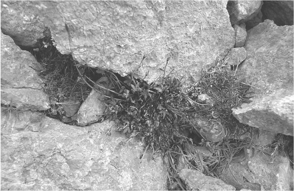
Fig. 3. Asyneuma junceum, with Alopecurus lanatus and Minuartia juniperina on the summit plateau of an unnamed lateral summit N of the Uyluk Tepe, Akdağ, Lycian Akdağları above Gömbe, c. 2900 m.