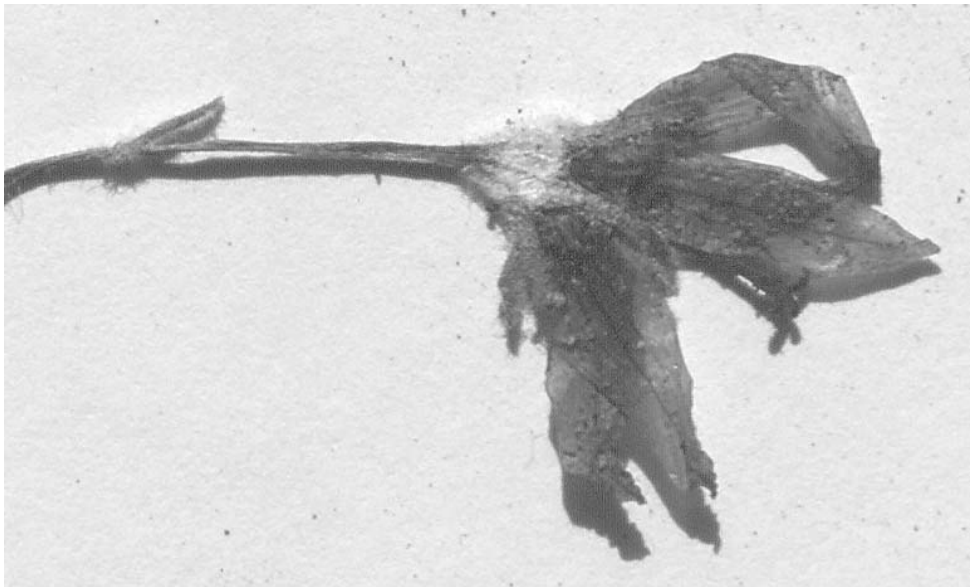
Fig. 5. Asyneuma compactum var. eriocarpum – flower in detail showing the dense lanate-tomentose indumentum of the ovary and calyx. – From the holotype at B.