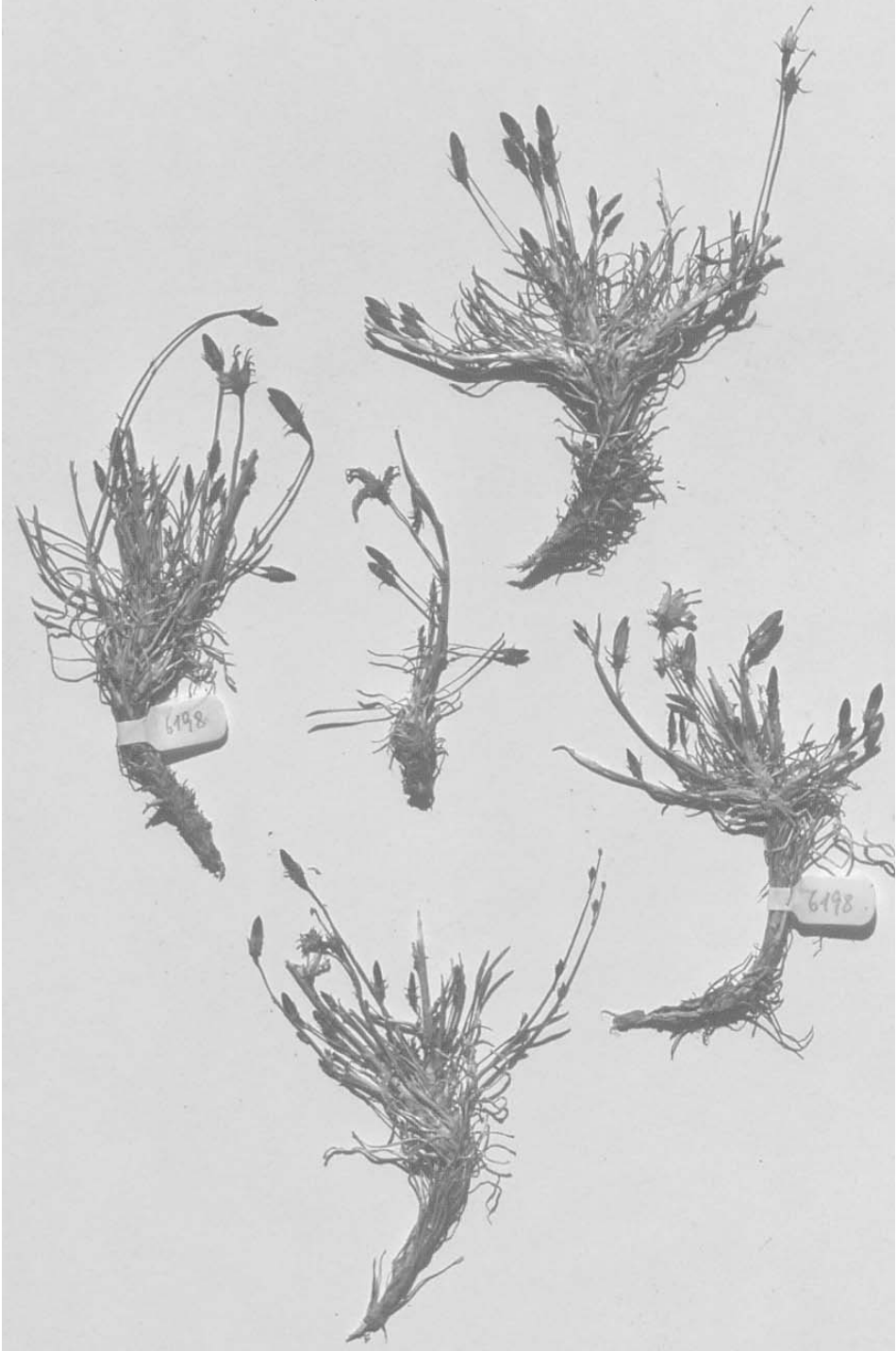
Fig. 2. Asyneuma junceum – Lycian Akdağları above Gömbe, Döring, Parolly 6198 & Tolimir (B).