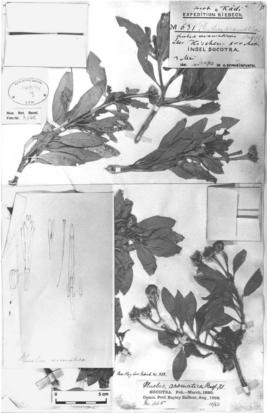
Fig. 1. Pulicaria aromatica – type sheet at Kew, with the lectotype Balfour 465 and the paralectotype Schweinfurth 631.