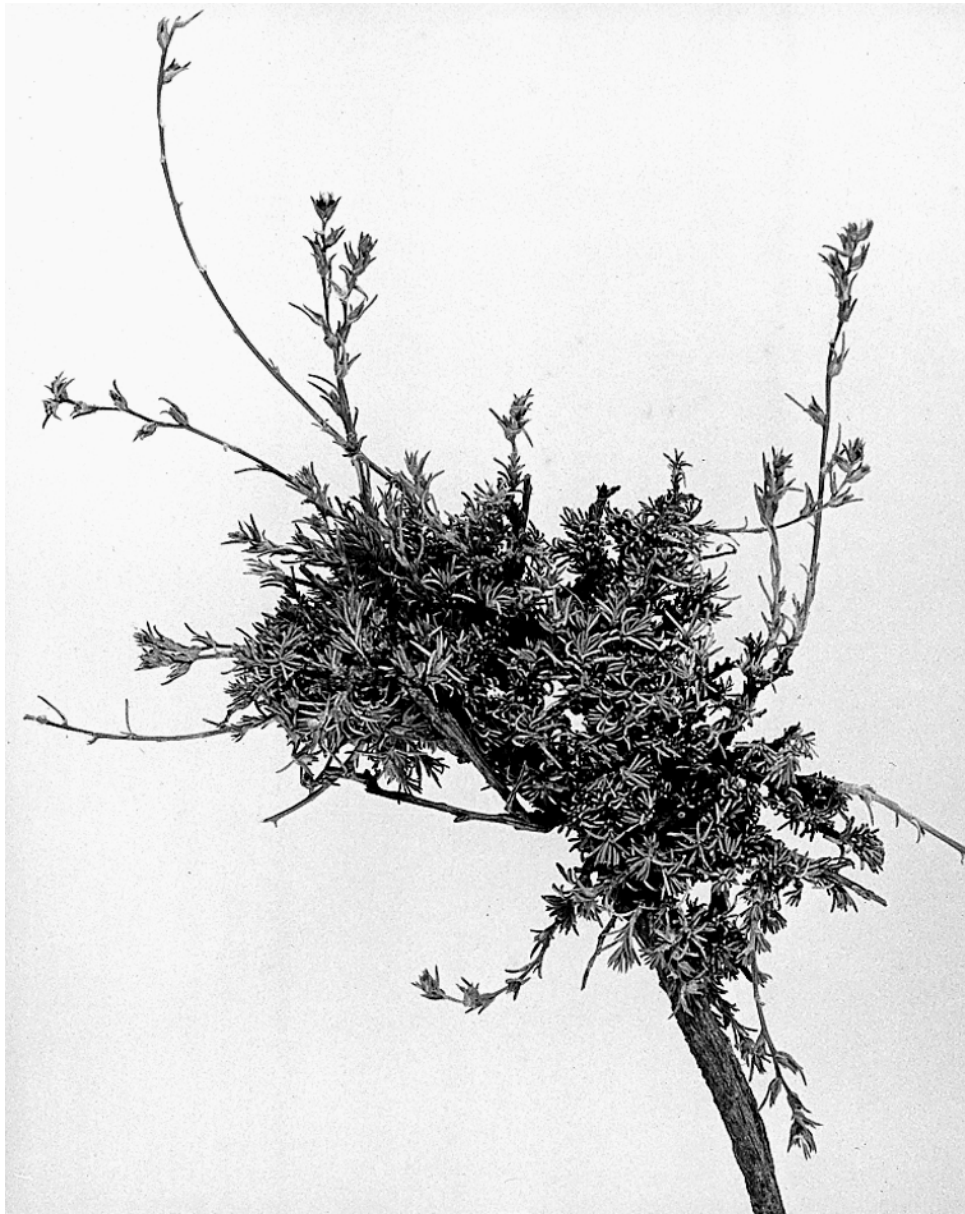
Fig. 1. Salsola canescens subsp. serpentinicola Freitag & E. Özhatay (holotype, ISTE 51123).

subsp. canescens still at hand from the Salsola account for “Flora iranica”, the SW Anatolian plants proved to be sufficiently distinct to give them, at least, subspecific rank. We hesitated to describe them as a new species because all differences except the length of anther appendages could well be induced by the peculiar habitat conditions. This refers in particular to the subulate leaves of subsp. serpentinicola (Fig. 2D), because similar thick and stiff leaves have been seen in a few specimens of subsp. canescens from dry localities in N Iran.