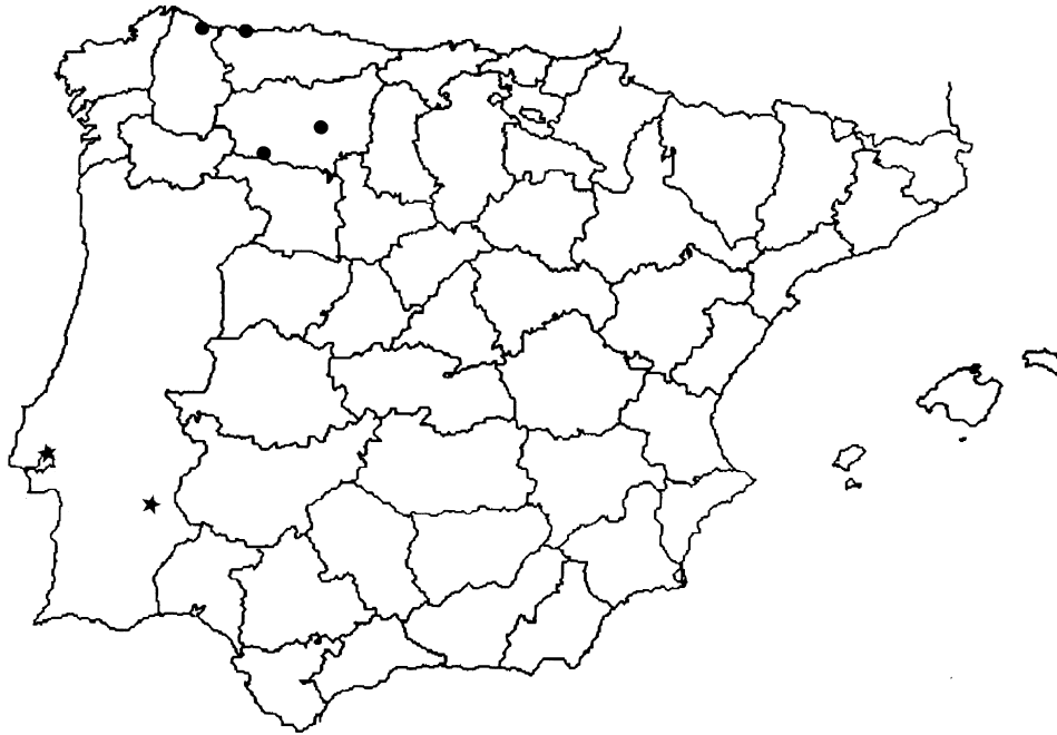
Fig. 2. Distribution of Bromus cabrerensis ● and B. nervosus ★.

800 \mu\text{m} thick, interrupted by a central cavity of 200–1700 \mu\text{m} in diameter. Epidermis with some prickles and macrohairs.