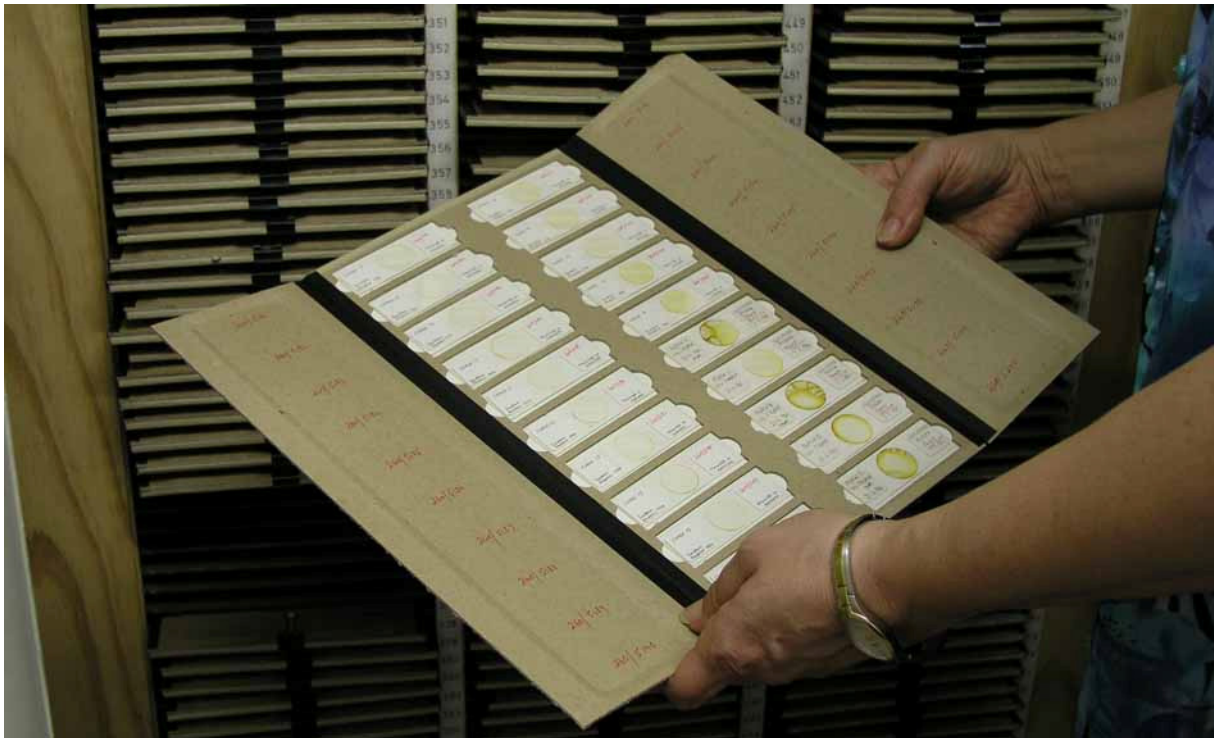
Fig. 2. Slides with original material of B. J. Cholnoky held by the Cholnoky Collection.

evaluation of Cholnoky's algal names; 3) selecting types where appropriate; and 4) databasing and digitizing Cholnoky's original drawings and specimens. This collection is in good basic order probably going back to the time when R. Archibald and F. Schoeman were caring for the collection at the CSIR in Pretoria. The non-use for two decades, its removal from active research into the basement at the CSIR in Pretoria when it became privately funded and when F. Schoeman left, its moving from Pretoria to the garage of Colin Archibald in Durban and finally to its current position at the CSIR in Durban disorganized the collection. In addition much of the know-how pertaining to the collection got lost due to its moving and discontinued curation.