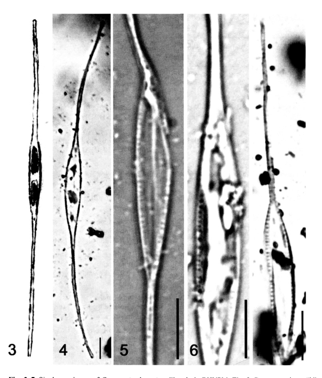
Figs 3–7. Single specimens of Ceratoneis closterium Ehrenb. in BHUPM. Fig. 3. Drawn specimen "b" from Drawing sheet No. 235. Fig. 4. Specimen on preparation No. 540032–3, see remains of two chloroplasts. Fig. 5. Lectotype-specimen, preparation No. 540032–3; see fibulae and twisted upper rostrum. Fig. 6. Further cell on preparation No. 540032–3. Fig. 7. Specimen with dense fibulae on preparation 360714-a. Scale bars = 10 \mu m .

We carefully weighted the pros and cons on priority versus stability. Since the genus Cylindrotheca is not based on a currently well known taxon, C. gerstenbergeri , which was found in a freshwater habitat and, in addition, is considered to be a later synonym of Ceratoneis gracilis which was not included in the original description of Rabenhorst's Cylindrotheca but in his later described Nitzschiella (Rabenhorst 1859, 1864), we refrained from the ordeal of conserving the superfluous generic name Cylindrotheca .