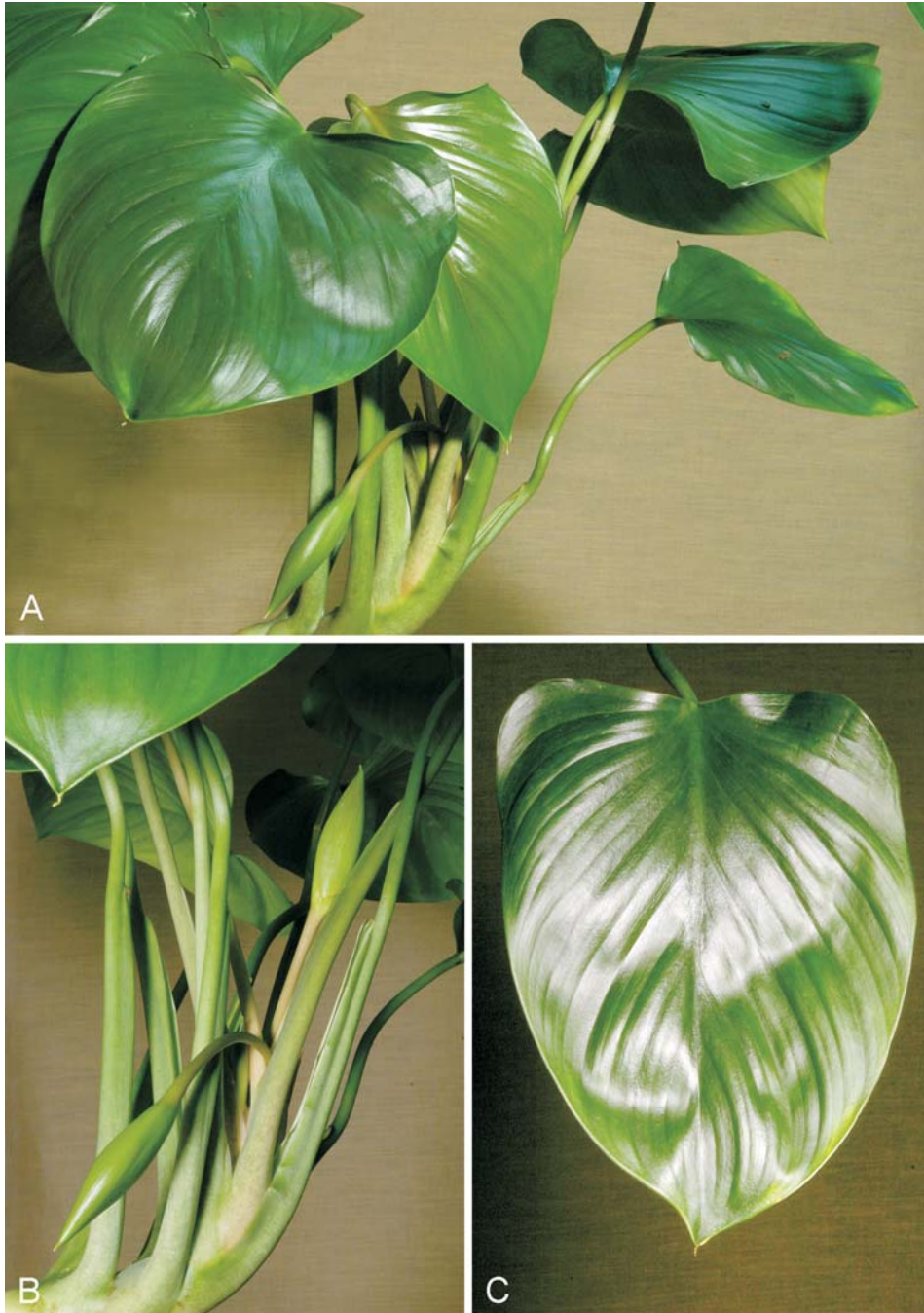
Fig. 1. Homalomena vietnamensis – A: habit of a flowering plant; B: lower part of the plant with two inflorescences, the younger one still erect and the other turned downwards after anthesis; C: single leaf, note the truncate base, the mucronate apex and the glossy upper side of the blade. – Plant cultivated at the Botanic Garden Munich from the same wild source as the holotype.