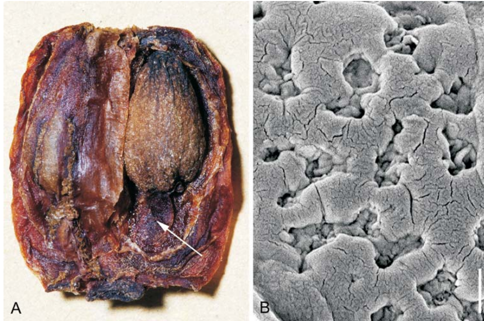
Fig. 3. Gorgonidium beckianum – A: berry, one locule opened to show the single ovoid, orthotropous seed with the funicle (arrow) still attached to the axile placenta; photograph from Kessler & al. 4823 (LPB) by G. Gerlach; B: exine of pollen grain, fissures in reticulum artificial by preparation; SEM micrograph by H. Halbritter.