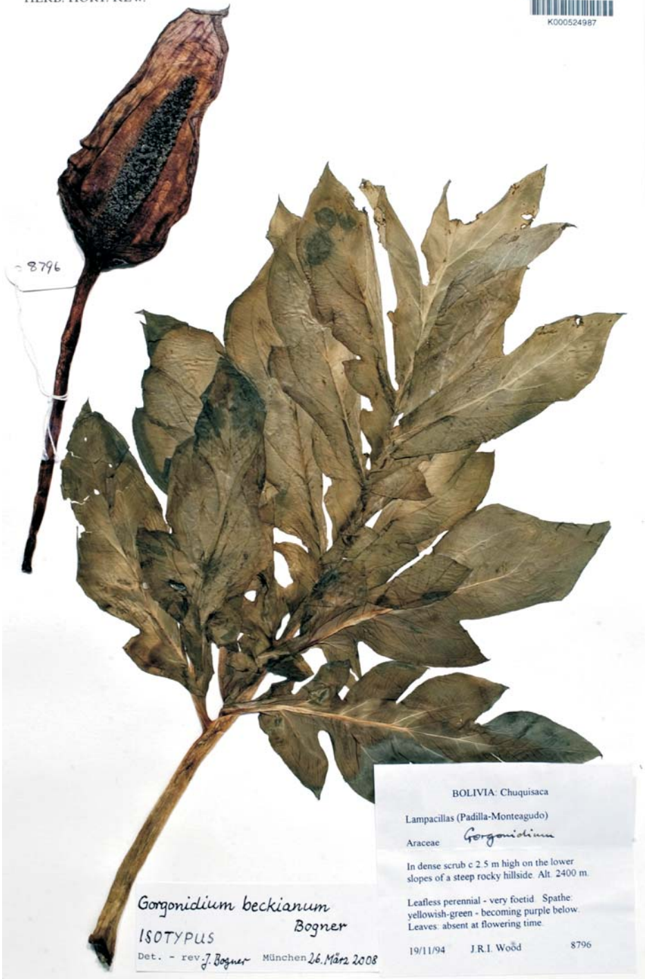
Fig. 2. Gorgonidium beckianum – isotype J. R. I. Wood 8796 at K.